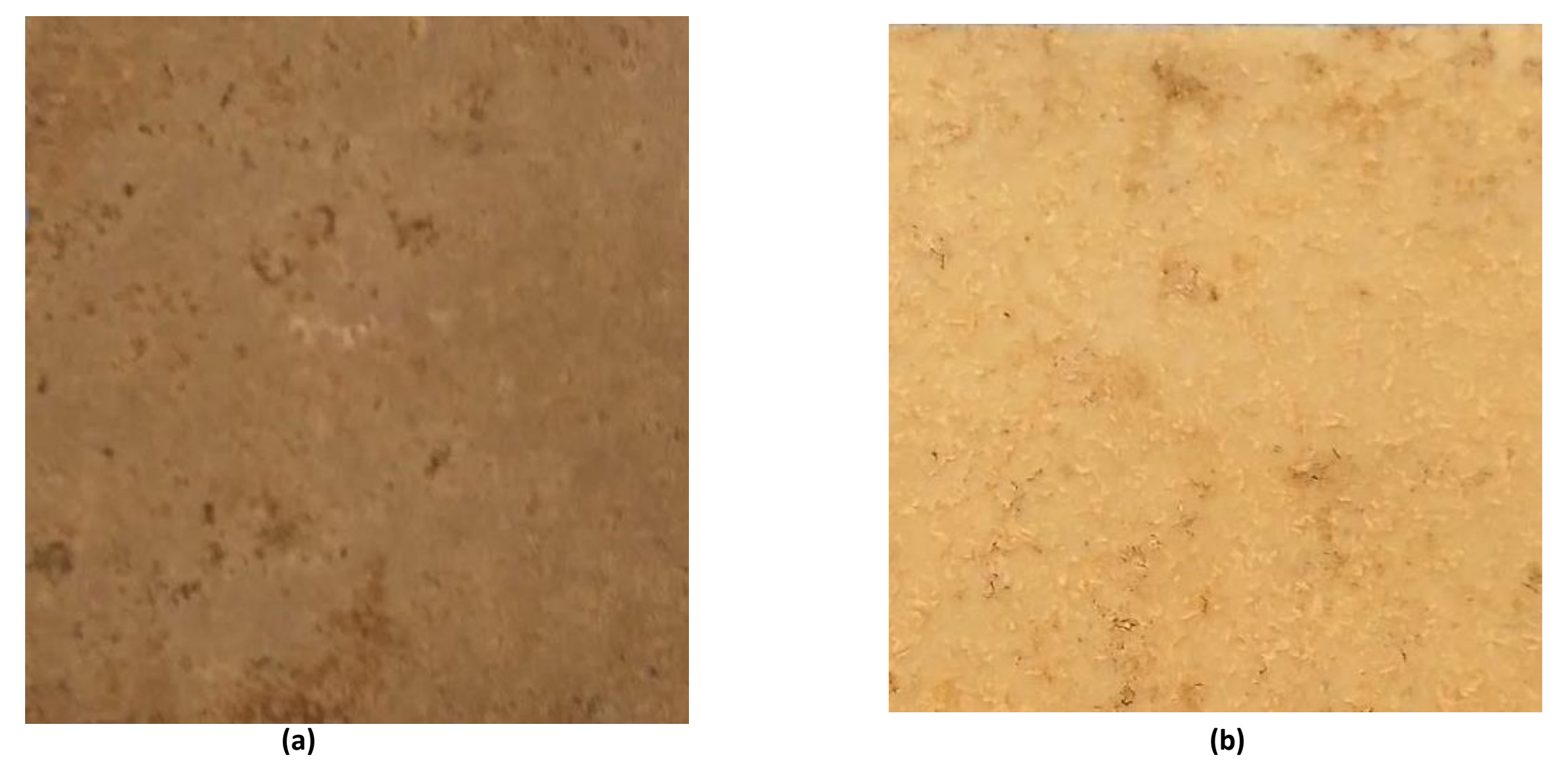
Figure 3- Surface of samples of PHBV with hemp fibre (a) and wood (b) moulded by compression moulding buried in soil for 8 weeks

stiff material with early fracture. In general, the fibres improve the biodegradation rate, but specially hemp showed a higher degree of degradation comparing with the neat PHBV.