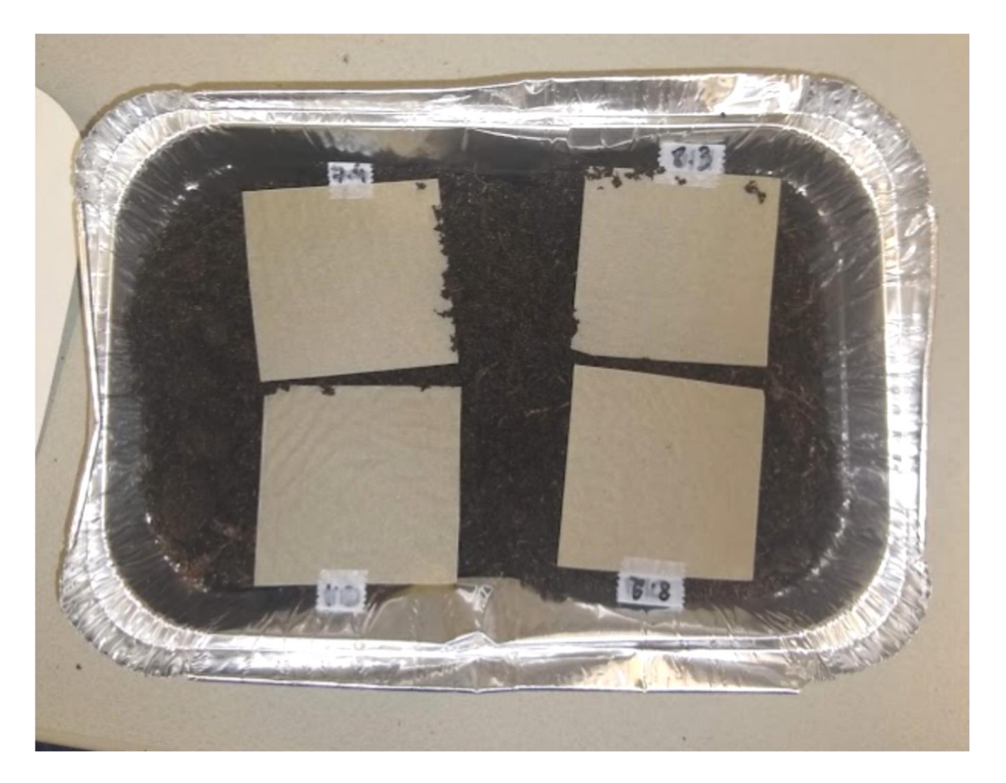
Figure 1- Samples of PHBV with hemp fibre moulded by compression moulding buried in soil for starting the biodegradation process.